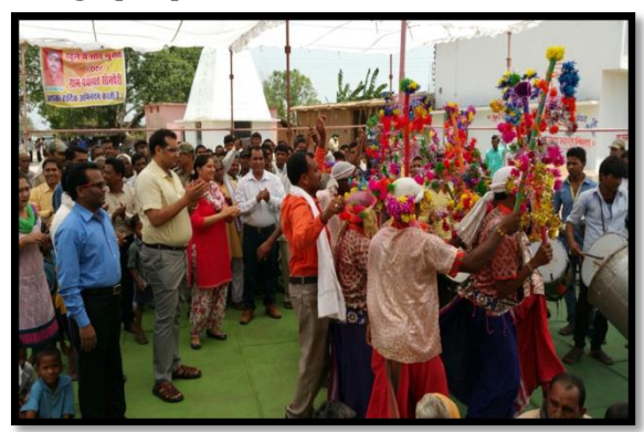
Awareness melas, song and dance as a means of generating awareness about sanitation

4. Song & drama activities: Local artists, singers, naatakmandlis , performers from the third gender , etc. may be engaged by the district for song, dance and drama performances to encourage people to build and use toilets.