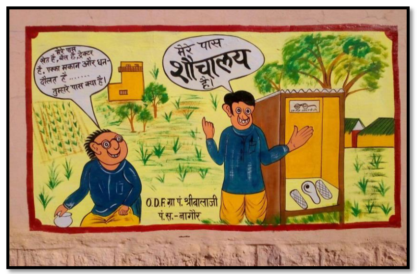
Wall writings / Painting

5. Wall Writing/Painting: Once the community has been triggered through Community Approaches to Sanitation, wall writing and paintings can be effective tools of reinforcing the message of ODF constantly. The messaging may be such that it 'sticks' and has an impact on the viewer / listener. Elements of surprise, humour, emotive appeals, positive reinforcements through celebrating Swachhta champions within the community and narrative formats increase the likelihood of retention of message.