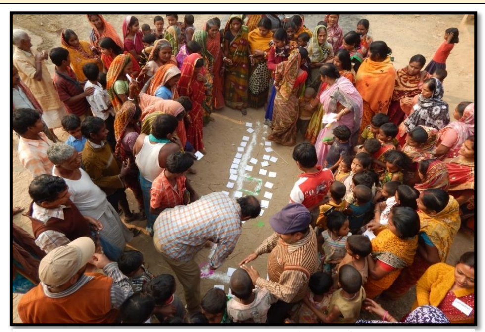
Triggering or Participatory Rural Appraisal

Similarly, coercive tools have to be avoided lest it should further alienate the community. At the most, the community may devise do's and don'ts for themselves and enforce internally. As long as such social pressure is exerted in a legal manner, the administration should not interfere with the initiatives taken by the community itself, nor be seen publicly advocating them.