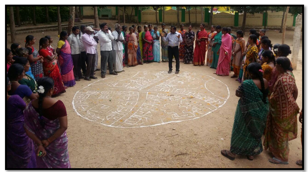
CAS Training of Swachhagrahis

1. CAS Training of Swachhagrahis: The most important IEC activity, that all districts must undertake on priority, is the training of grassroots motivators in Community Approaches to Sanitation (CAS). This training is delivered by many organizations, using different brand names, such as CLTS, CATS, etc. The Ministry of Drinking Water and Sanitation has also recently empaneled a number of Key Resource Centres (KRCs) for Sanitation. The empaneled KRCs are equipped to conduct CAS trainings, and may be hired by the districts at pre-approved rates, mentioned in the Sanitation KRC Guidelines uploaded on the Ministry website (<a href="http://mdws.gov.in/key-resource-center-training">http://mdws.gov.in/key-resource-center-training</a>)