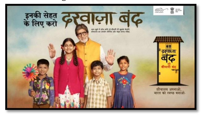
Mass Media Campaigns on TV/Radio