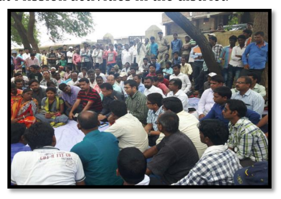
Awareness and Training Workshops

10. Awareness and Training workshops: Training workshops for sensitization, awareness generation and technical training of district officials, masons, Swachhagrahis, etc. are very useful to build the human resource needed to lead and sustain Swachh Bharat Mission activities in the district.